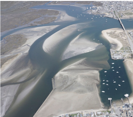
Aerial Photo looking North from Seabrook

Hampton Harbor was last dredged Oct 2012 - Feb 2013 when approximately 115,000 CY of sandy material was removed from the FNP and 52,000 CY was removed from the State Maintained Anchorage with placement at Seabrook Beach and Hampton State Beach Park.